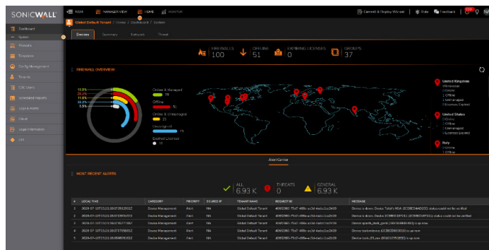
Figure 1.0 Executive Dashboard

Analytics comes with a broad range of pre-defined reports that can be delivered on-demand or on a regular schedule. It also allows you the flexibility to custom-build reports with values and metrics chosen from an extensive library of firewall data types, allowing you to assemble and logically extract valuable insights from specific devices across selected groups or tenants. Custom reports help declutters data funnels, giving decision-makers and responders clearer